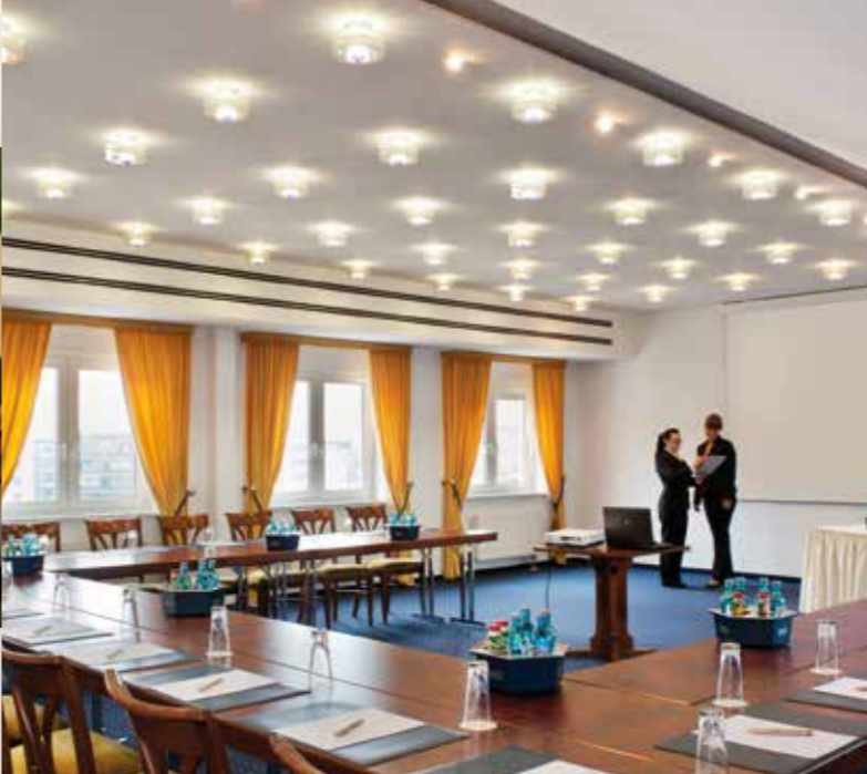
FOR A MORE RELAXED CONFERENCE: 5 VERSATILE FUNCTION ROOMS