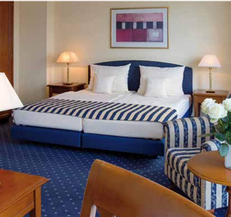
COMFORTABLE AND INVITING: ROOMS AND JUNIOR SUITES