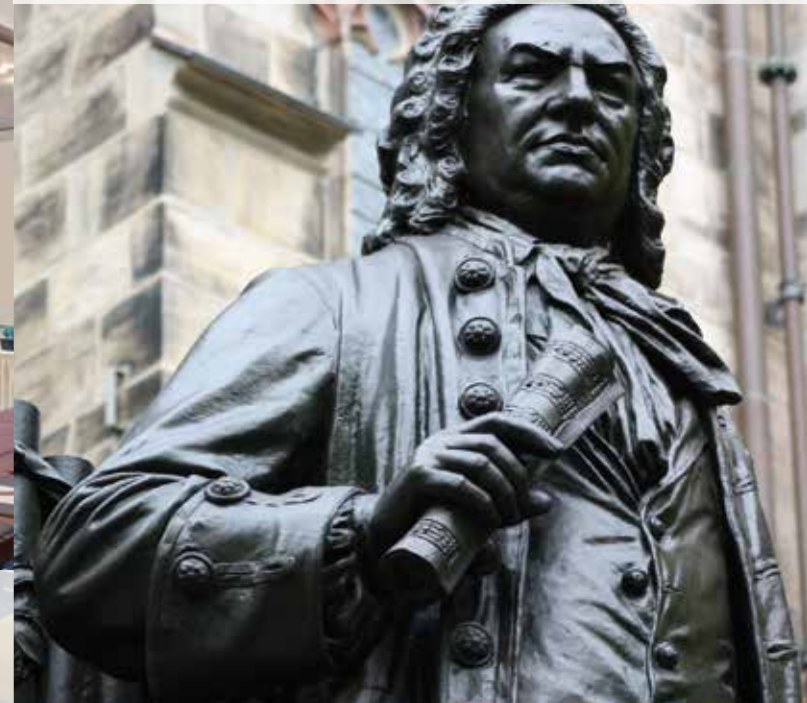
IN THE THICK OF THINGS: CENTRAL LOCATION AT THE GATEWAY TO THE OLD TOWN