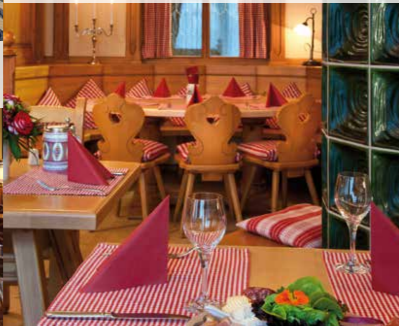
A PIECE OF BAVARIA IN THE MIDDLE OF LEIPZIG: THE KLOSTERSTUBE