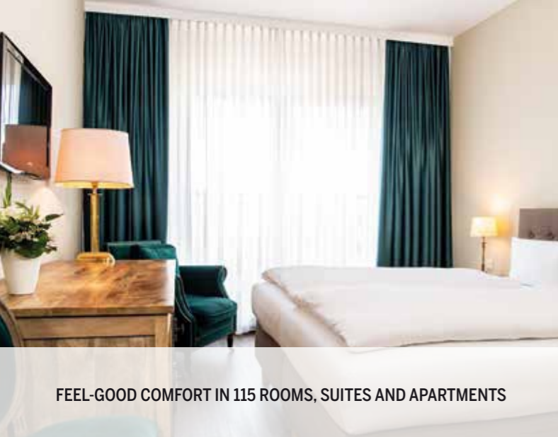
FEEL-GOOD COMFORT IN 115 ROOMS, SUITES AND APARTMENTS