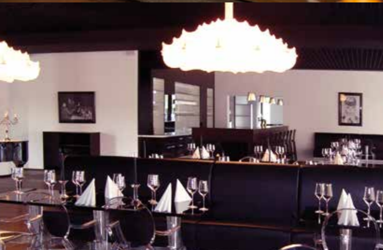
STYLISH AND ELEGANT: THE CLUB, EXCLUSIVE EVENT VENUE