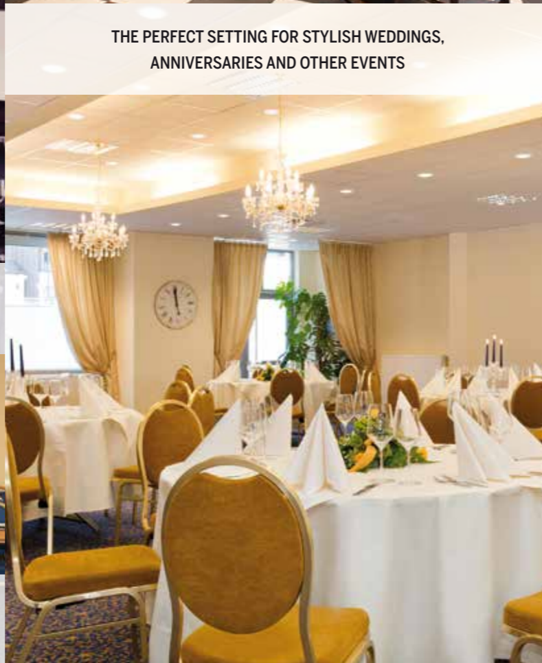
ENDLESS POSSIBILITIES IN 10 CONFERENCE AND FUNCTION ROOMS