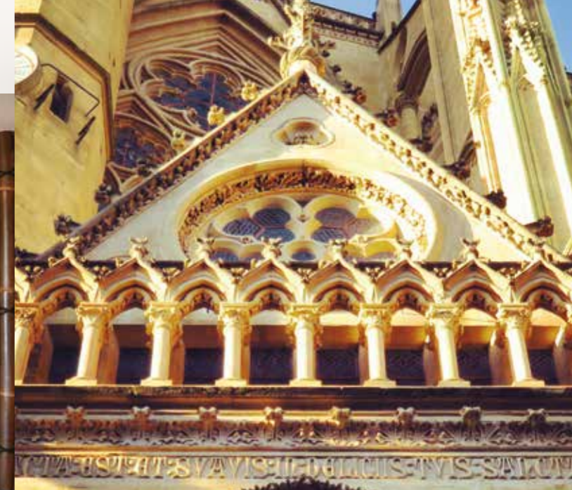
JUST AN HOUR'S DRIVE TO METZ, A CITY OF CULTURE