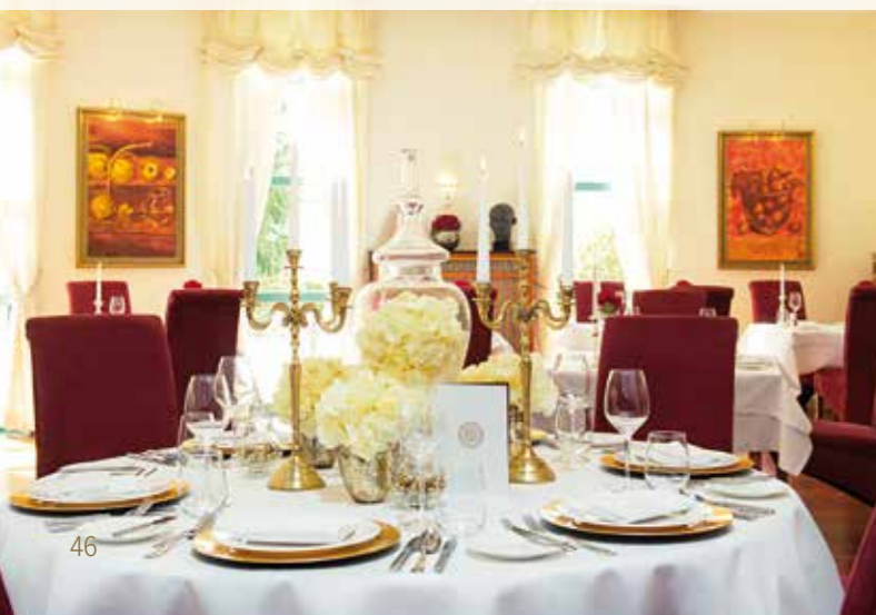
THE RESTAURANT BACCHUS SERVES ITALIAN SPECIALITIES ON THE MENU