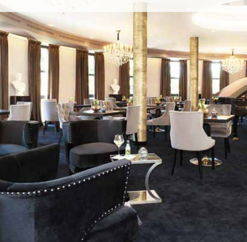
PURE ELEGANCE: TAKE A SEAT IN CAESAR'S BAR