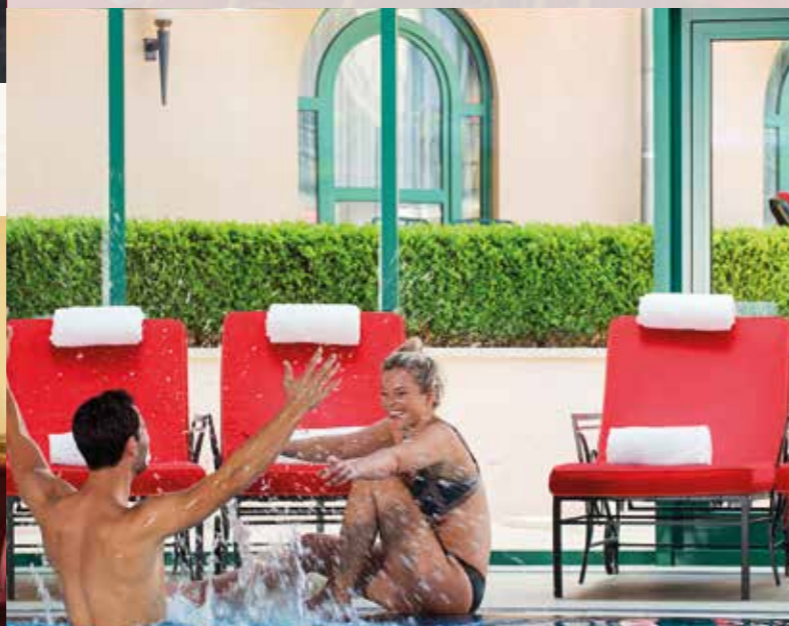
DOLCE VITA IN THE WELLNESS AREA WITH A POOL AND SAUNA

Victor's RESIDENZ-HOTEL SCHLOSS BERG ★★★★★ S