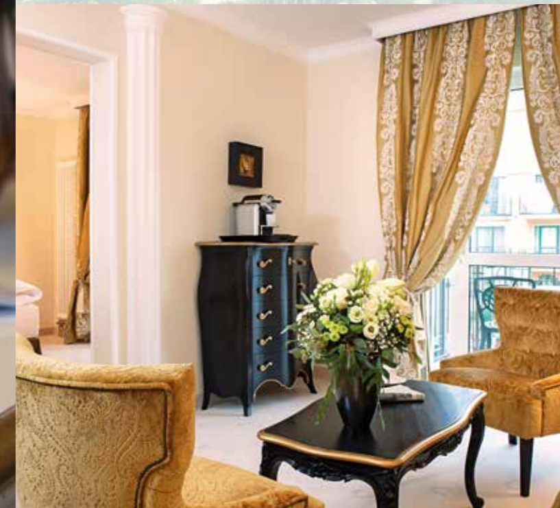
A PERFECT DREAM: THE "FABULINUS" ROMAN SUITE

Have the stars always held a magical attraction for you? They do for us, too. Which is why there are so many of them at Schloss Berg. A warm welcome to our 5-star Superior hideaway – and the culinary home of 3-star chef Christian Bau.