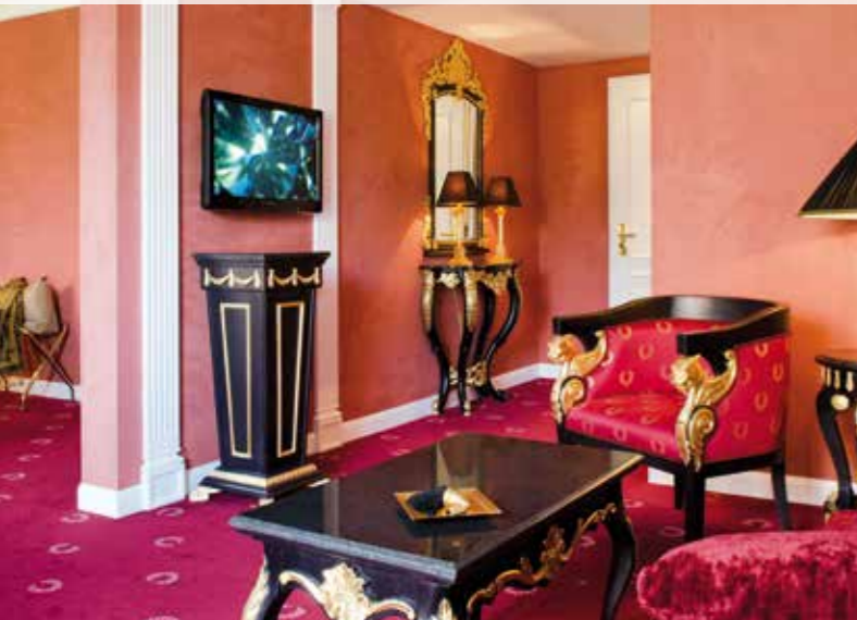
"APOLLO" – ONE OF THE LUXURIOUS ROMAN SUITES, EACH OF WHICH HAS 2 BATHROOMS