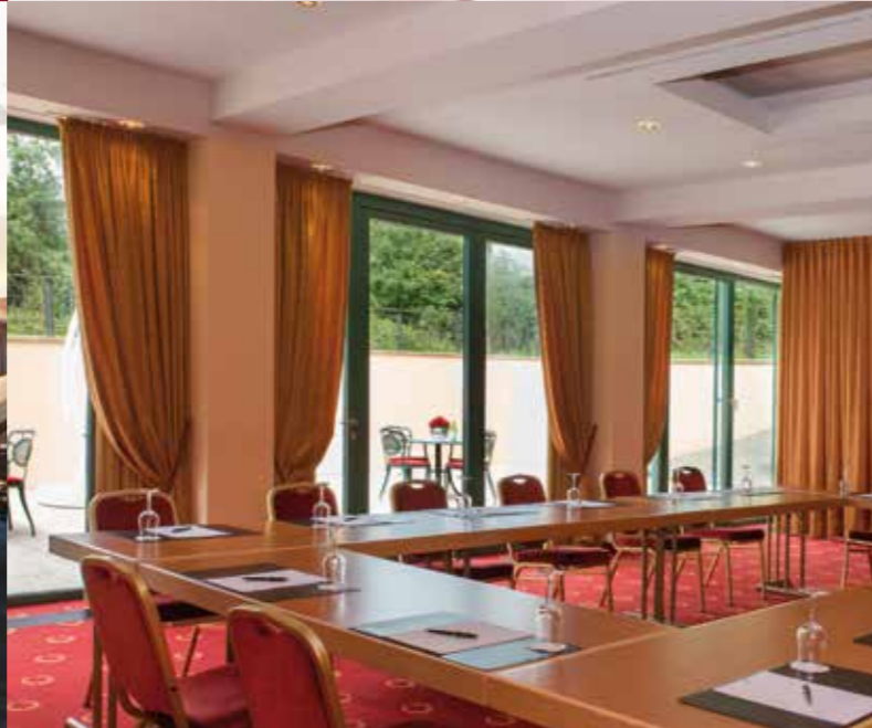
FLOODED WITH LIGHT, AND PARTLY ACCESSIBLE BY CAR: 4 CONFERENCE ROOMS