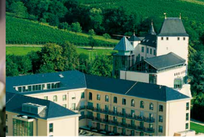
IDYLIC LOCATION IN THE BORDER TRIANGLE BETWEEN GERMANY, FRANCE AND LUXEMBOURG