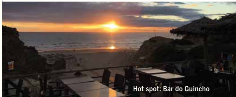
Hot spot: Bar do Guincho